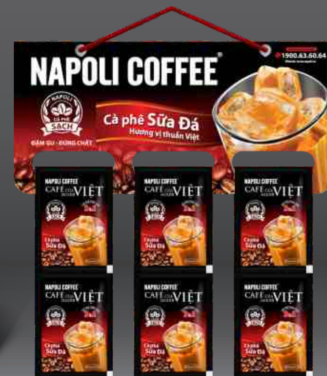
INSTANT COFFEE 3IN1 BAG 35 SACHETS