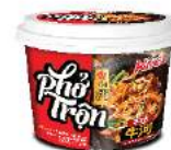
Hanoi instant rice noodle Beef flavor