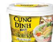
Hanoi instant rice noodle Chicken flavor