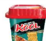
Kool instant noodle Crab Salted Egg Noodle