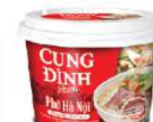
Hanoi instant rice noodle Beef flavor