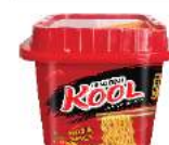
Kool instant noodle Spicy Salted Egg Noodle