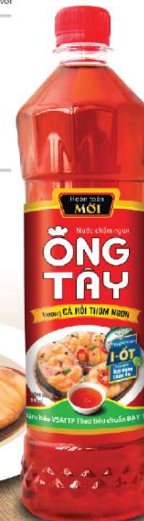
Ong Tay Fish sauce