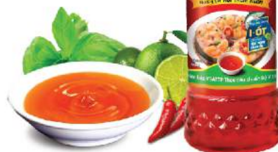
Fish Sauce: Ông Tây Capacity: 800ml

Fish sauce has two essential ingredients: fish and salt. Choosing the best quality fish is crucial in making a fragrant fish sauce. The fish should be fresh, clean, and about the same size.