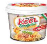
Kool Spaghetti Stewed beef