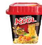
Kool instant noodle Salted Egg flavor