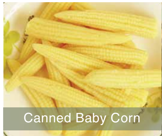
Canned Baby Corn