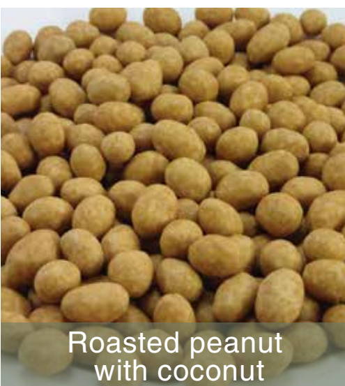
Roasted peanut with coconut