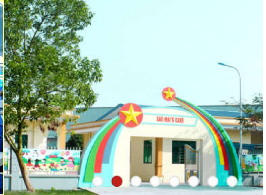
Some pictures at Sao Mai 3