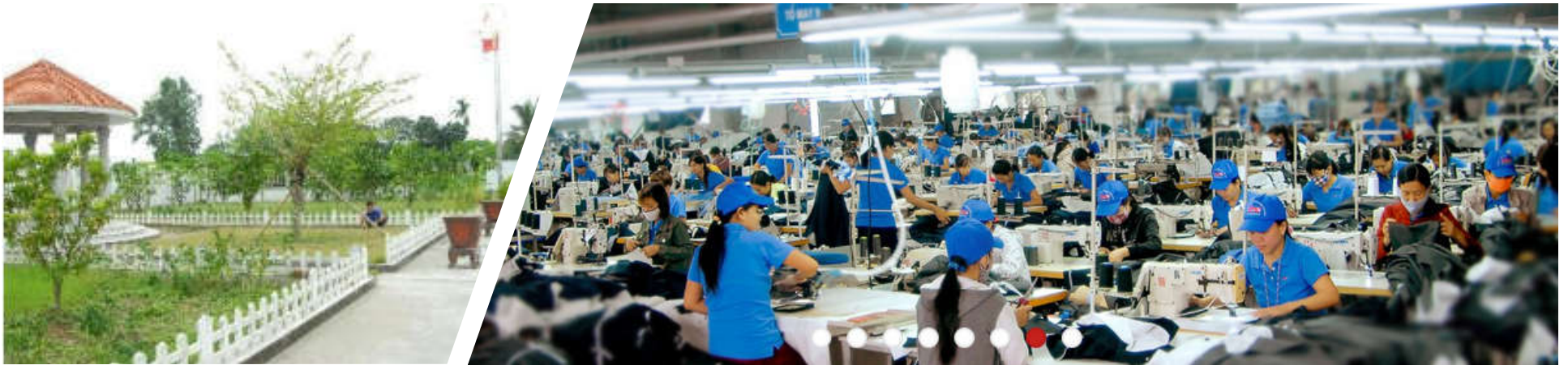
Some pictures at Sao Mai 2