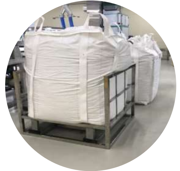
STERILIZED BY OXYLOW