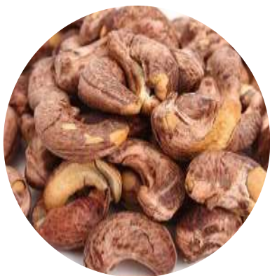
ROASTED CASHEW NUT SHELL WITH SALT