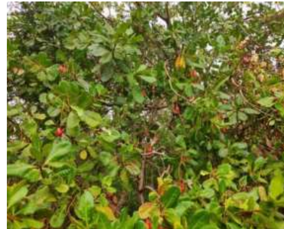
CASHEW TREE IN HARVEST TIME