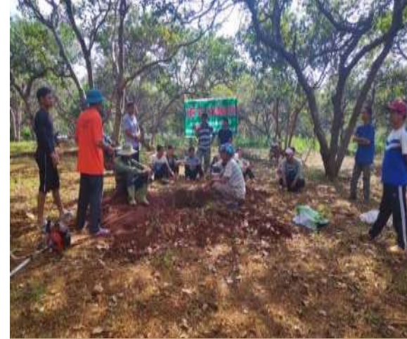
FARM OFFICER TRAINING