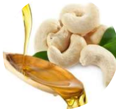
CASHEW NUT OIL