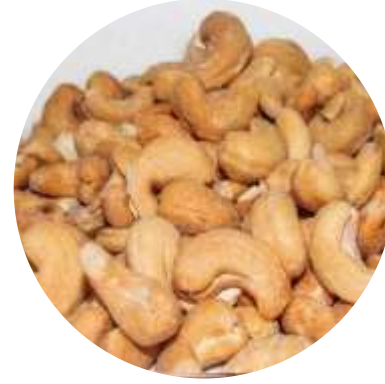
ROASTED CASHEWS WITH SALT