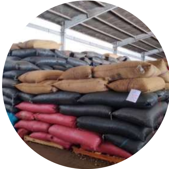
MATERIAL IN WAREHOUSE