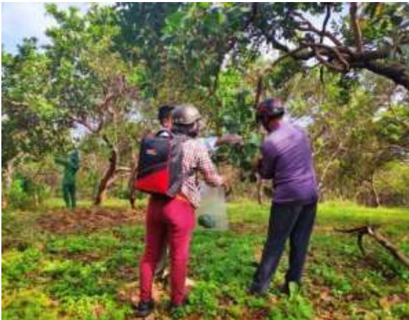
CHECK ANNUAL CASHEW LEAVE