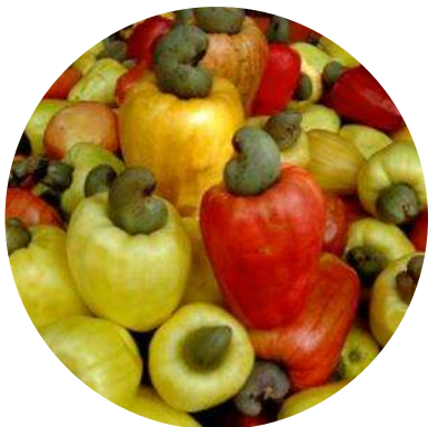
FRESH CASHEW KERNELS LIVE