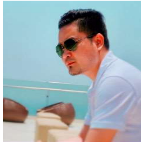
International Business Dept

Cellphone: +84965220086 Email: lamnt@fomexco.com