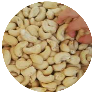
DRIED CASHEW NUTS