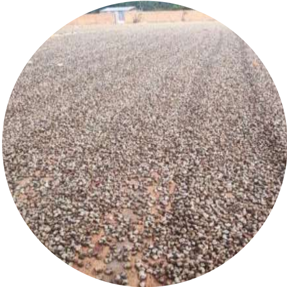
DRYING YARD AT FACTORY