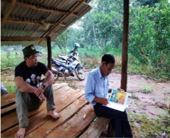
FARM OFFICER WORKING AT SITE