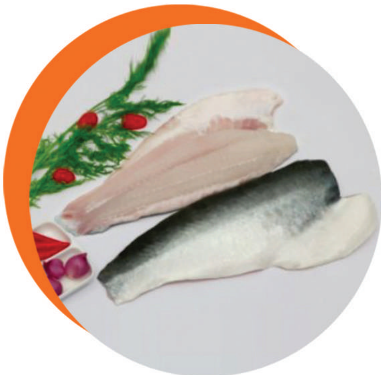
Frozen Pangasius Fillet Skin on