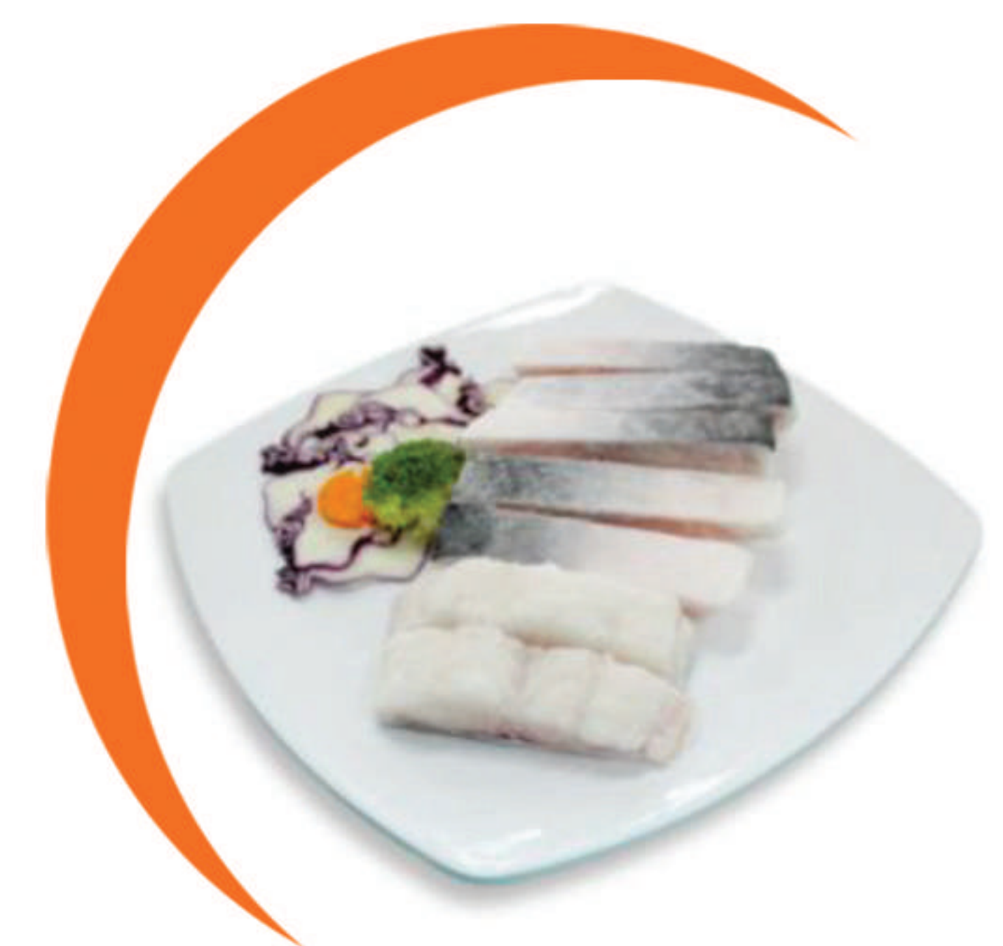
Frozen Pangasius Portion Fillet, Skin on