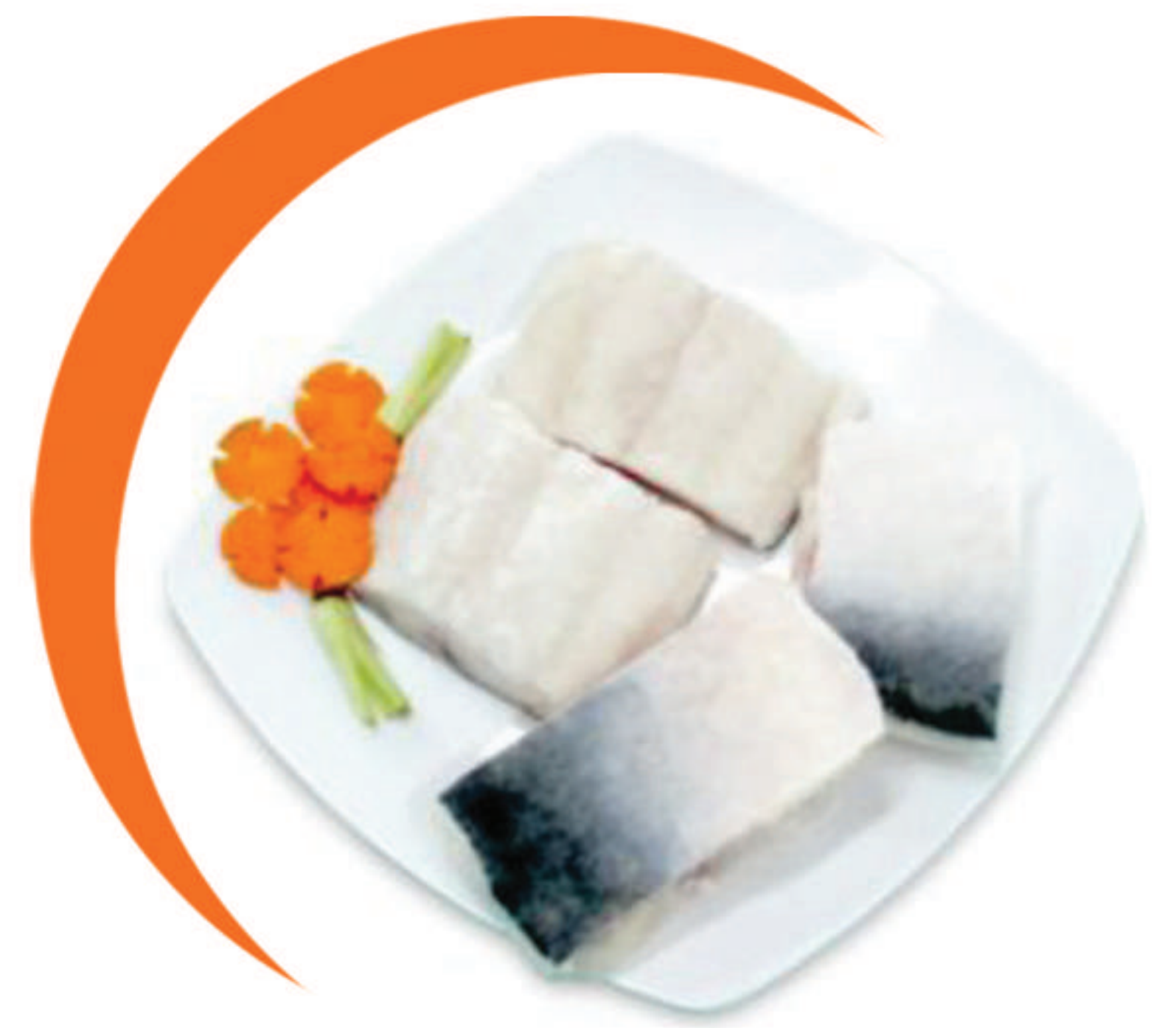
Frozen Pangasius Portion Fillet Skin on