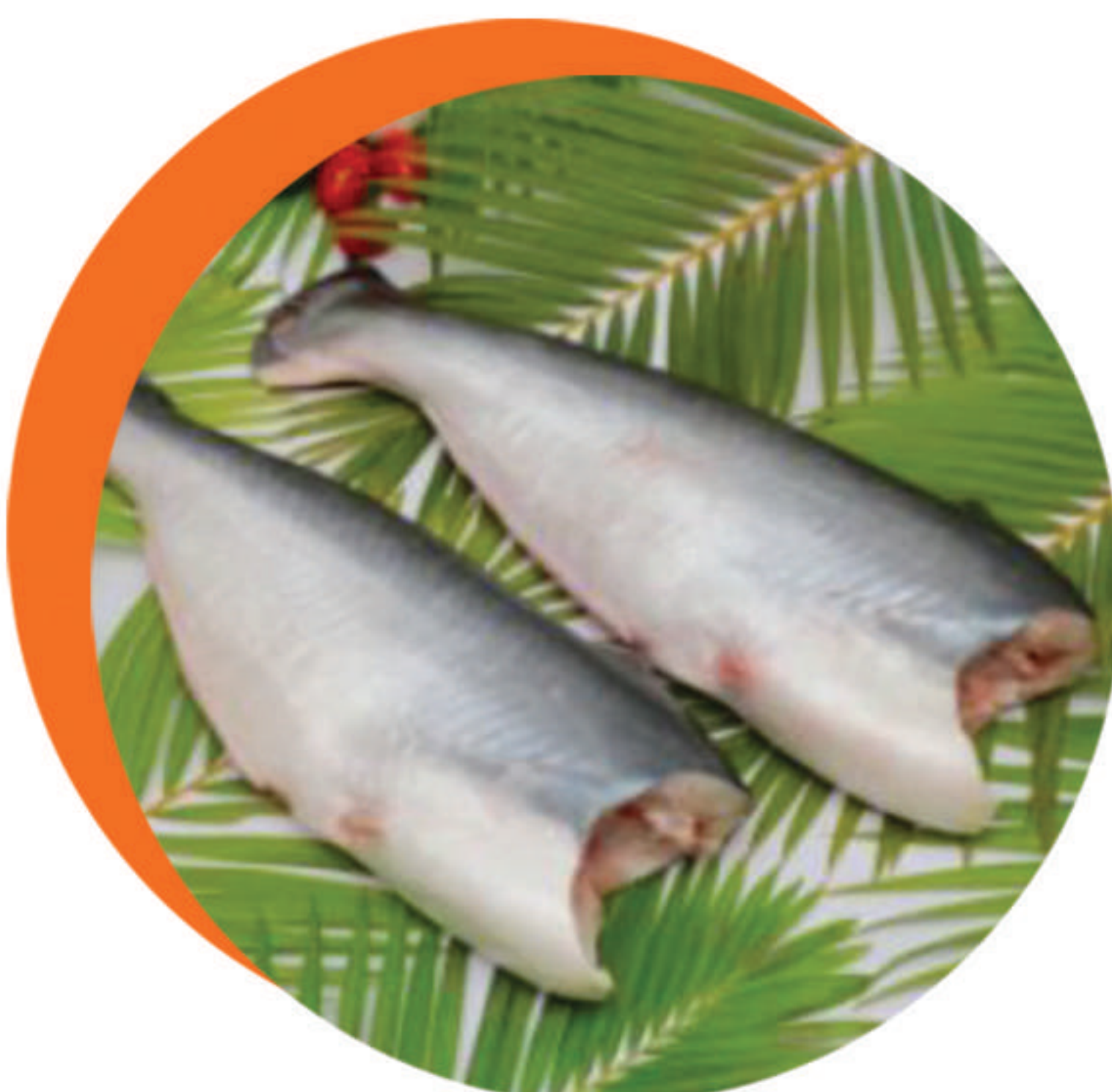
Frozen Pangasius Whole Round, Head off