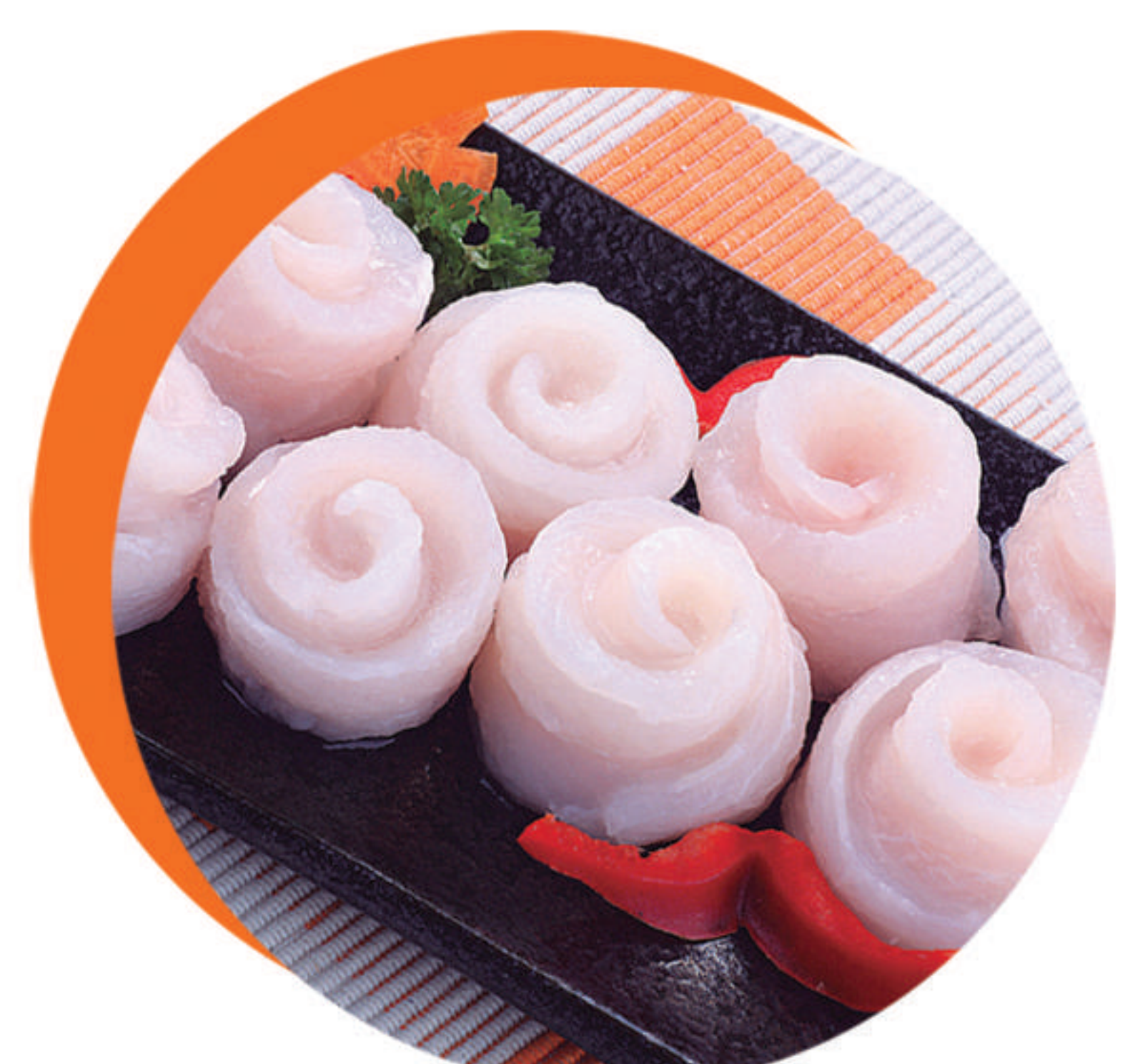
Frozen Pangasius Rolls