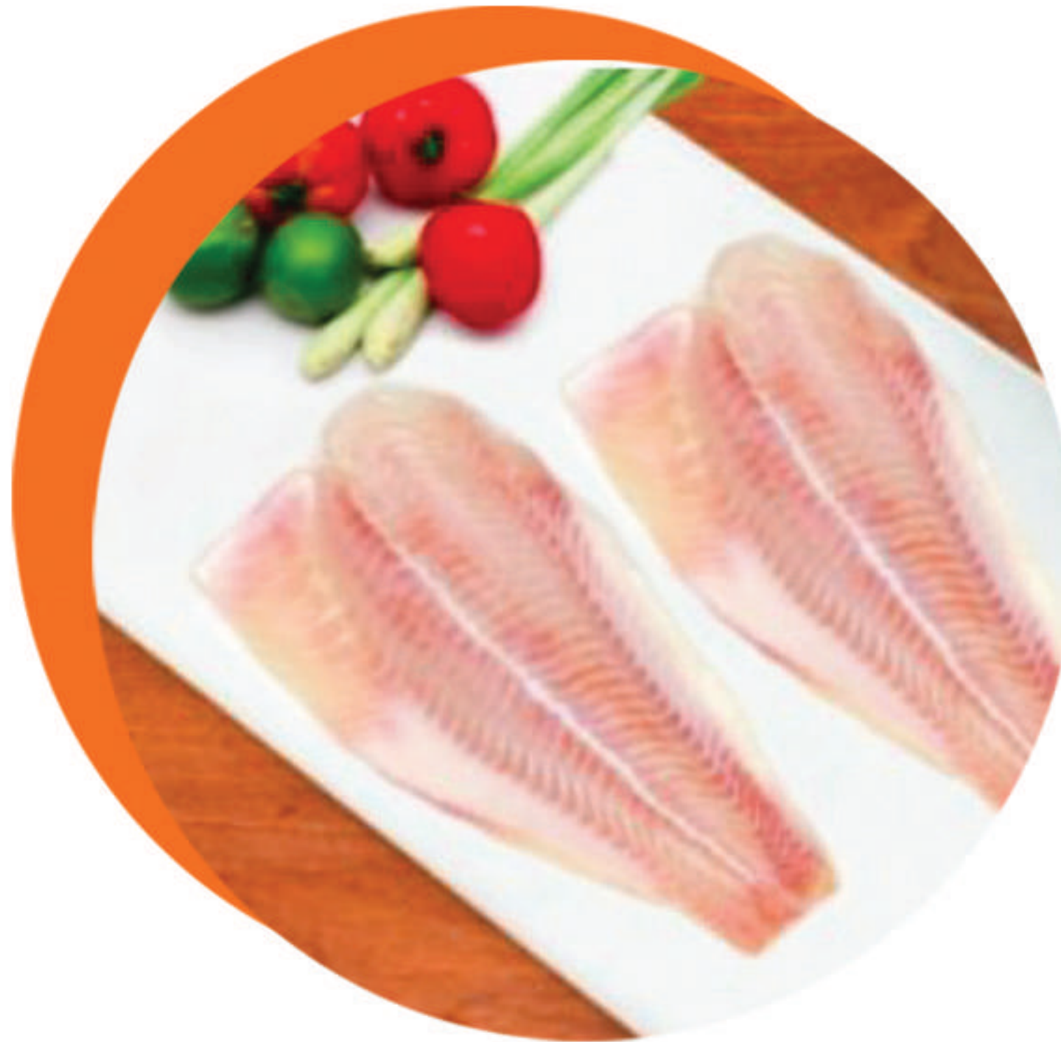
Frozen Pangasius Fillet Semi Trimmed