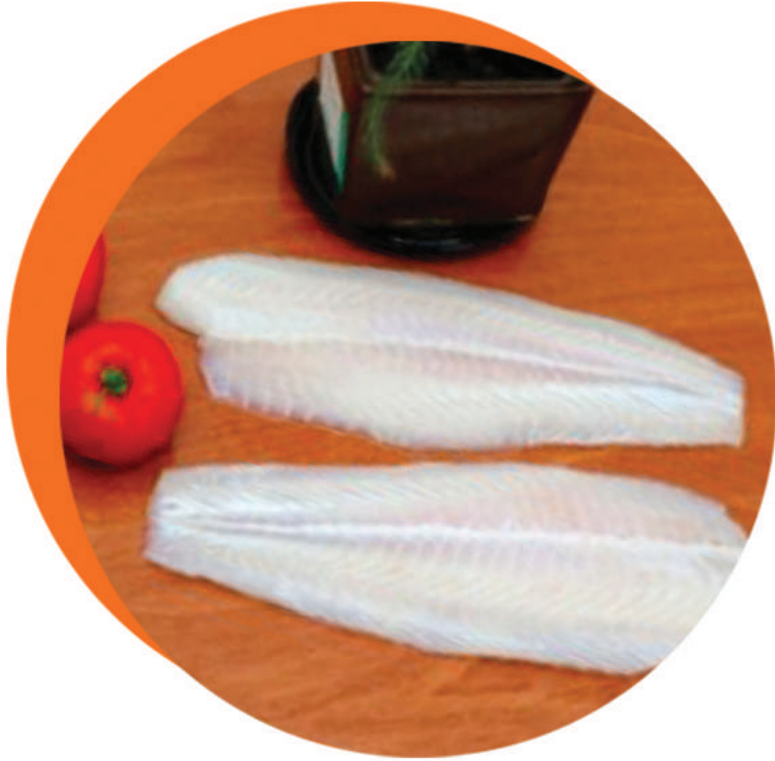
Frozen Pangasius Fillet, Skinless, Boneless, Well Trimmed