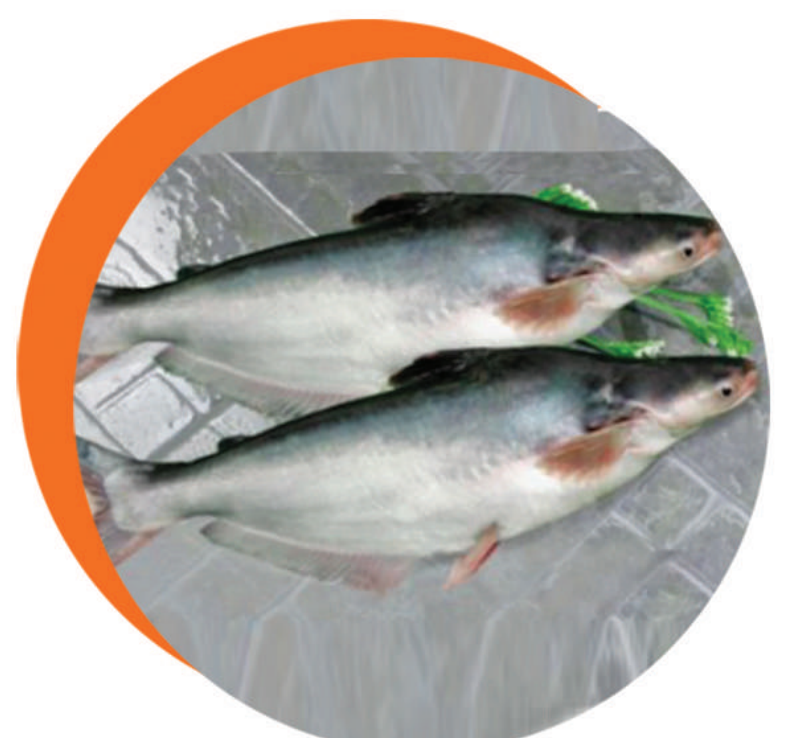
Frozen Pangasius Whole Round