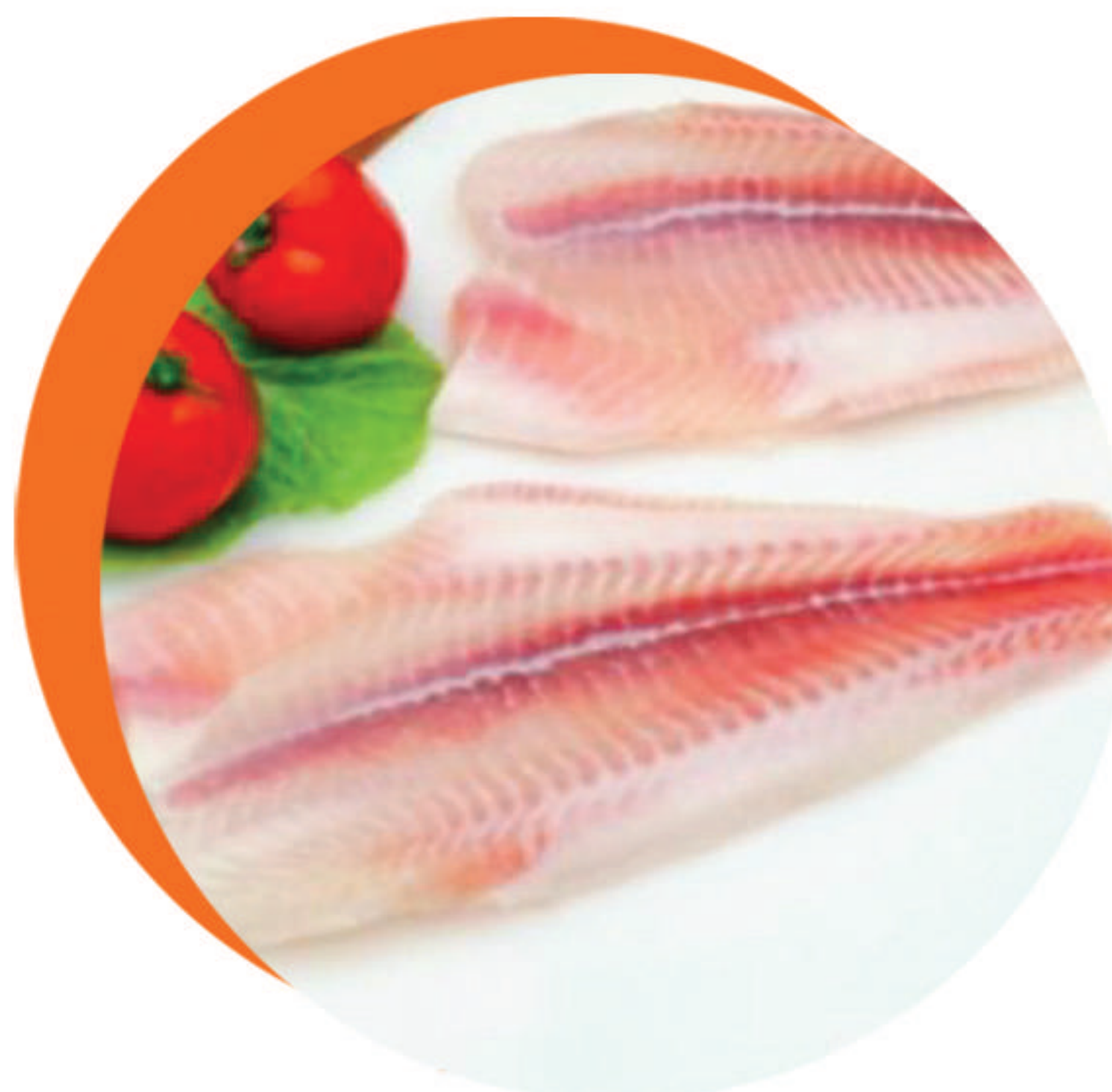
Frozen Pangasius Fillet, Semi Trimmed, Red Meat on, Belly off, Fat off