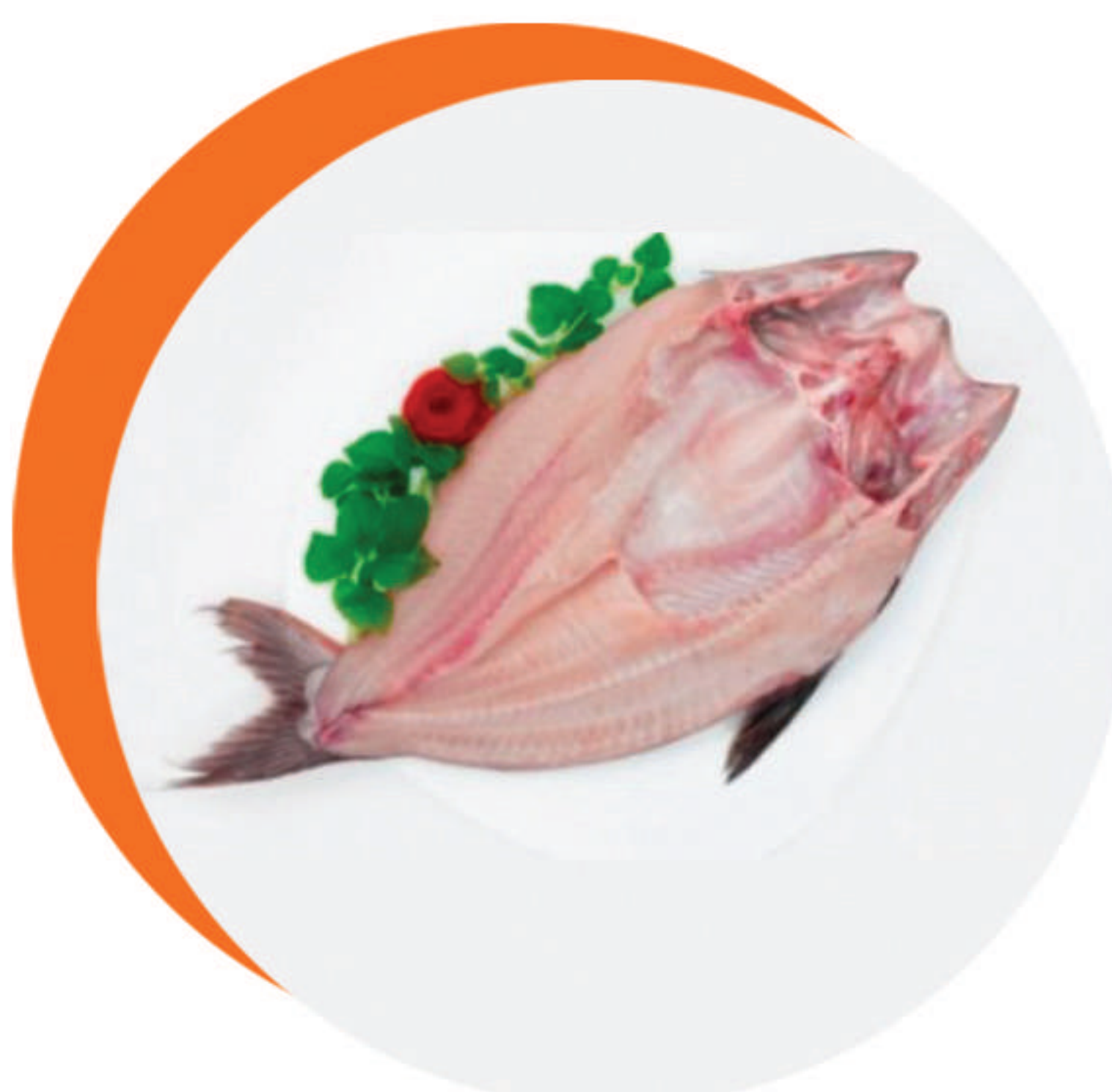
Frozen Pangasius Butterfly