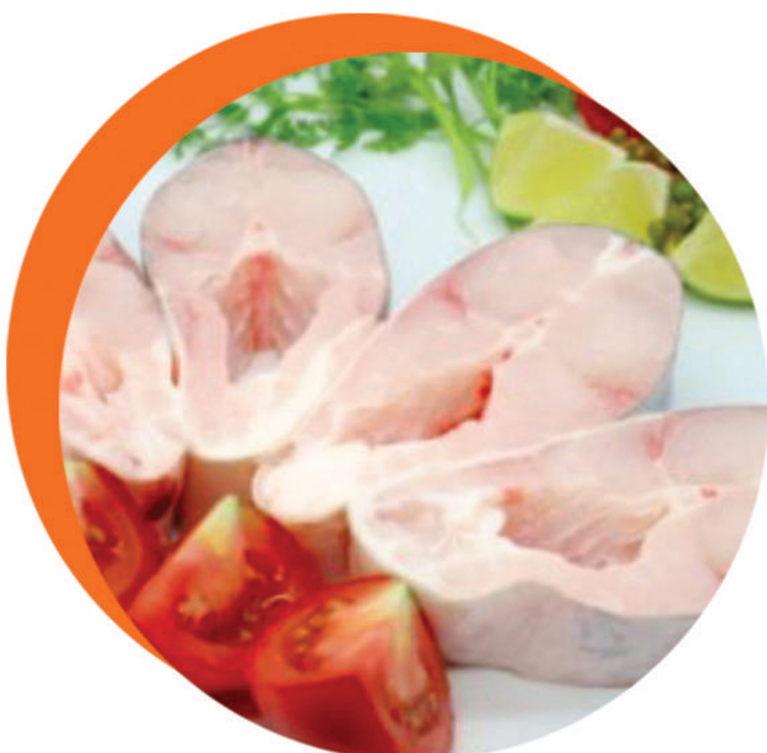
Frozen Pangasius Steak