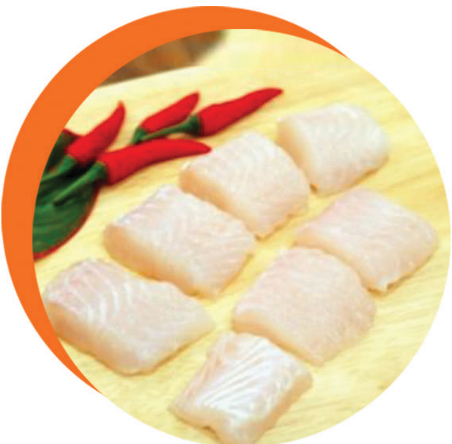
Frozen Pangasius Portion Fillet