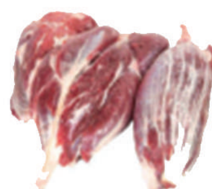
Shine / Shank