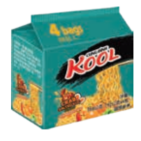
Crab Salted Egg Flavor