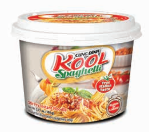
105g/bowl x 12 bowls/carton 1220/2820 ctns per container 20HQ/40HQ

Spaghetti flavor - another best-selling item under the KOOL brand. With this convenient and modern packaging, the taste of Italy can now be experienced anywhere.