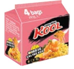
Cheese Salted Egg Flavor