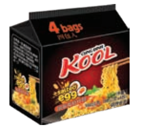
Original Salted egg flavor

12 packs/carton 1000/2350 ctns per container 20'DC/40'HC