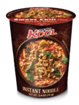
Sweet chili flavor 70 g