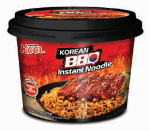
105g/bowl x 12 bowls/carton 1220/2820 ctns per container 20HQ/40HQ