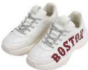
NEW YORK YANKEES