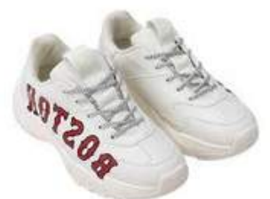
NEW YORK YANKEES