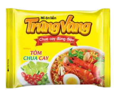
Flavour SPICY & SOUR SHRIMP Net. 63 gr | Carton 30 packs