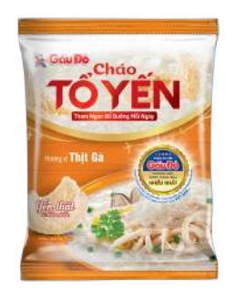
Flavour CHICKEN Net. 50 gr | Carton 30 packs