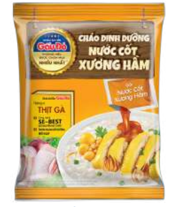
Flavour CHICKEN Net. 57 gr | Carton 30 packs