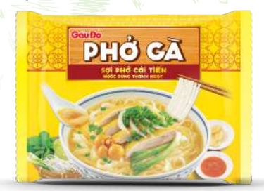
Flavour PHO CHICKEN Net. 65 gr | Carton 30 packs