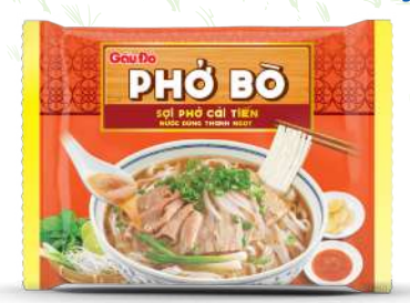
Flavour PHO BEEF Net. 65 gr | Carton 30 packs