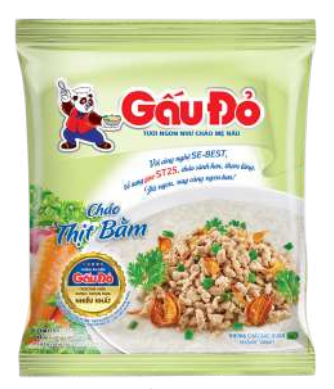
Flavour MINCED PORK Net. 50 gr | Carton 50 packs