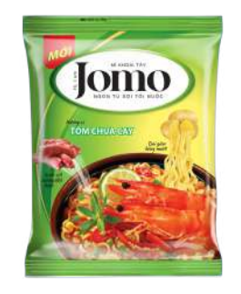
SPICY & SOUR SHRIMP Net. 80 gr | Carton 30 packs