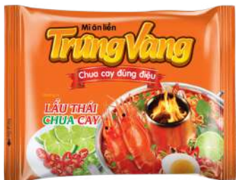
Flavour SPICY & SOUR THAI HOT POT Net. 63 gr | Carton 30 packs