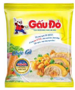
Flavour CHICKEN Net. 50 gr | Carton 50 packs