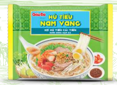
Flavour PHNOM PENH NOODLES SOUP Net. 68 gr | Carton 30 packs