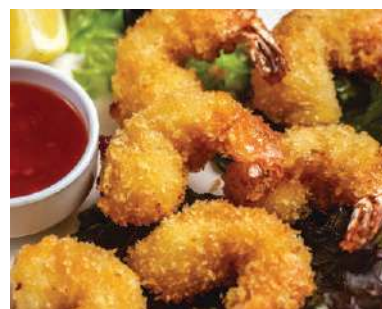
Tempura Shrimp Curve