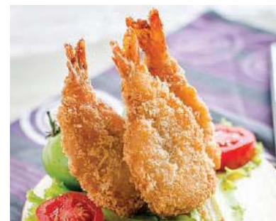
Breaded Butterfly Shrimp