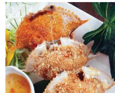
Seafood On Crab Shell