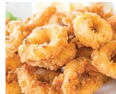
Breaded Squid Ring