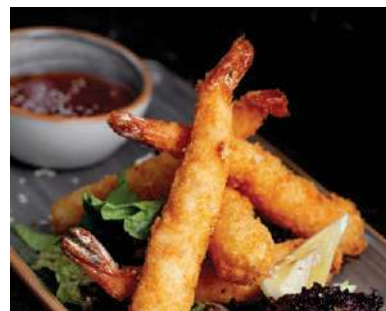
Breaded Torpedo Shrimp