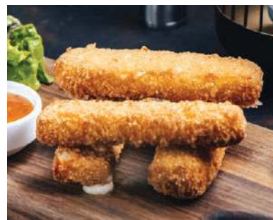
Breaded Fish Finger