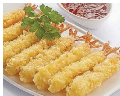
Agedama Breaded Shrimp