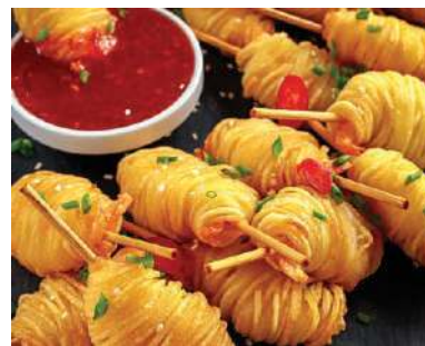
Potato Covered On PTO Shrimp