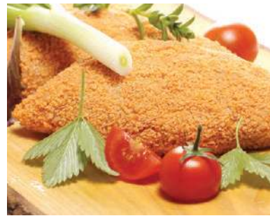
Breaded Pangasius Fillet