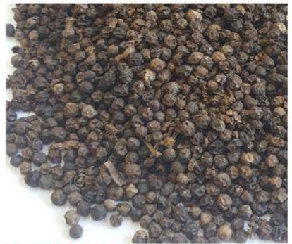
Light Berries Black Pepper 300g/l