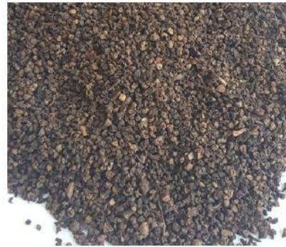
Pinhead Black Pepper 1-1.5mm