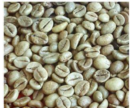
Robusta Screen 18 Wet Polished