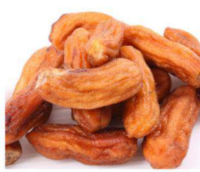
Soft Dried Banana