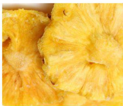
Soft Dried Pineapple