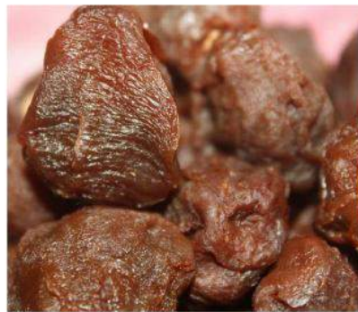
Soft Dried Lychee - Shelled