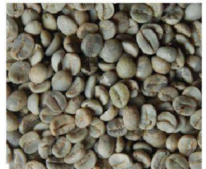
Arabica Screen 18 Wet Polished