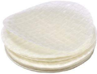
Rice Paper 16-18-22-28-31 cm Round/ Square shape