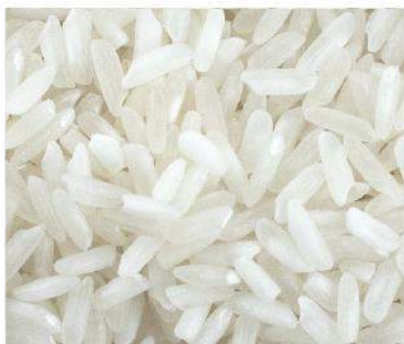
Long Grain White Rice 5%/ 15%/ 25%/ 50% Broken