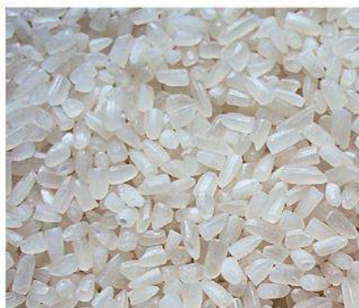
Rice 100% Broken