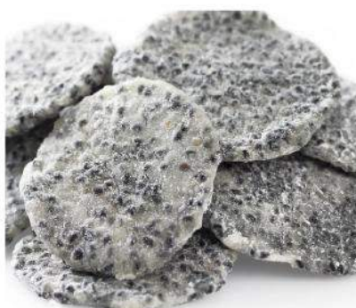
Soft Dried Dragon Fruit