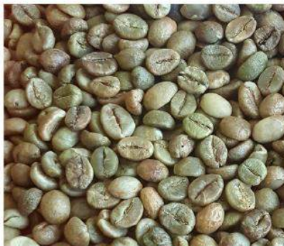
Robusta Screen 18 Unwashed