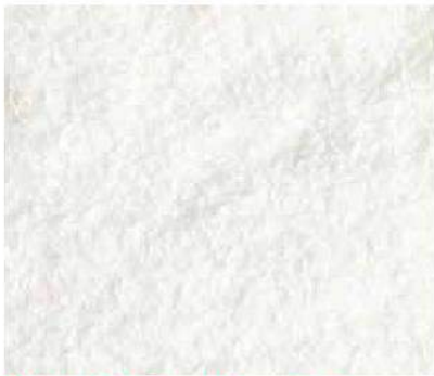
High/ Medium/ Low Fat Fine Grade