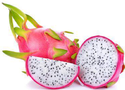
Fresh White Dragon Fruit