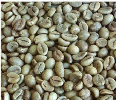
Robusta Screen 16 Wet Polished