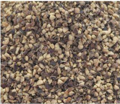
Cracked Black Pepper Mesh 16-28