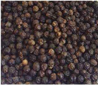
Black Pepper 550g/l Cleaned