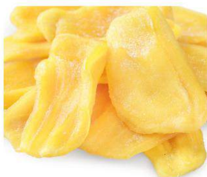
Soft Dried Jackfruit