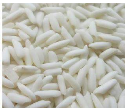
An Giang Glutinous Rice