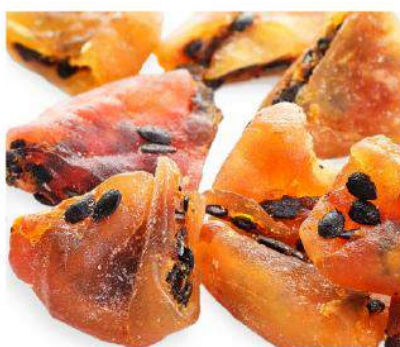
Soft Dried Passion Fruit