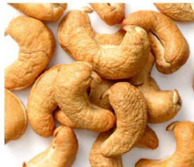
Roasted Cashew Without Skin