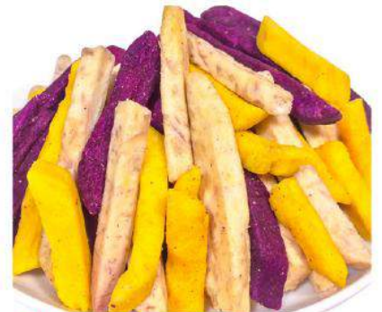
Crispy Dried Sweet Potato