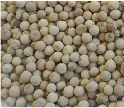
White Pepper 630g/l