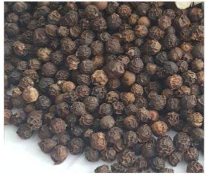
Black Pepper 600g/l Cleaned