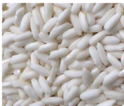
Long An Glutinous Rice