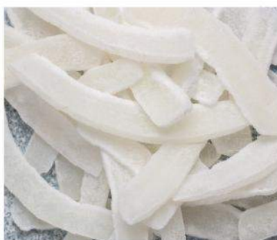
Soft Dried Coconut