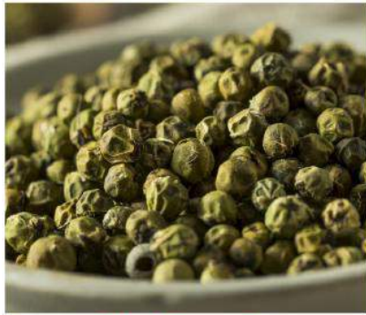
Freeze-Dried Green Pepper