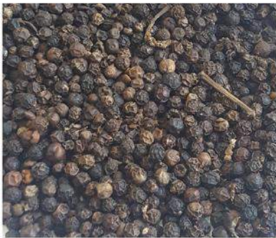
Black Pepper 500g/l FAQ