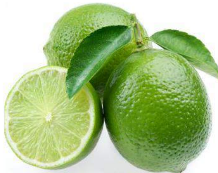
Fresh Seedless Lime