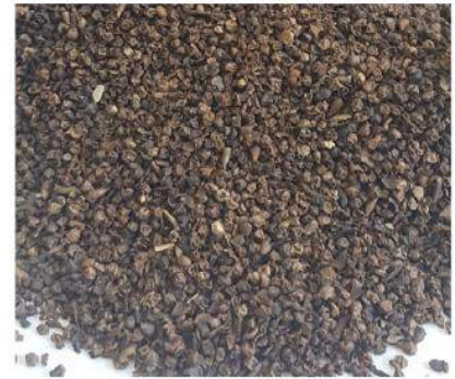
Pinhead Black Pepper 1.5-2mm