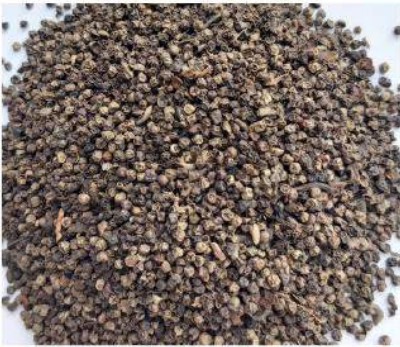
Pinhead Black Pepper 2-2.5mm