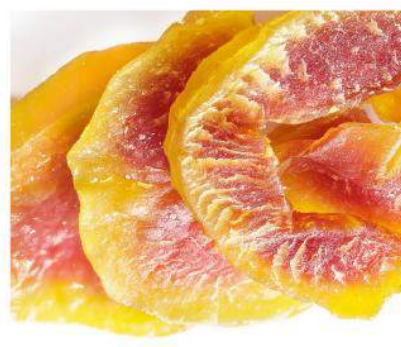
Soft Dried Papaya