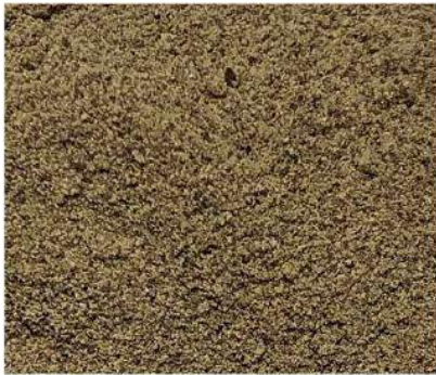
Ground Black Pepper Mesh 60-80