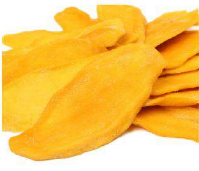
Soft Dried Mango