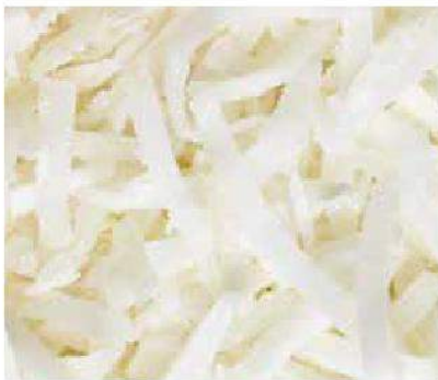
High Fat - Flake Grade