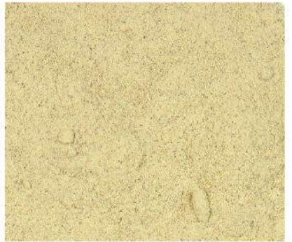
White Pepper Powder