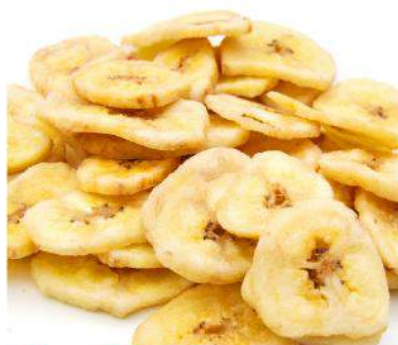
Crispy Dried Banana