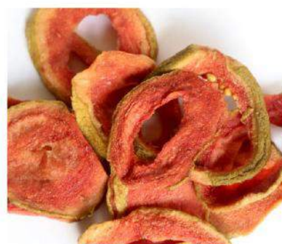
Soft Dried Guava