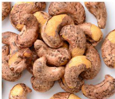
Roasted Cashew With Skin