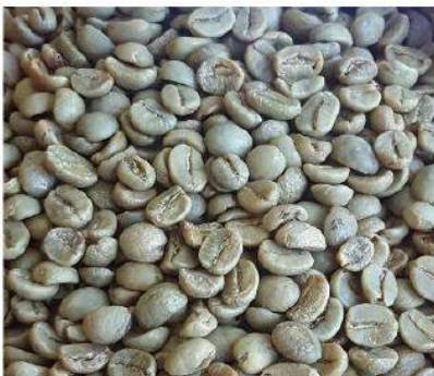
Arabica Screen 16 Wet Polished