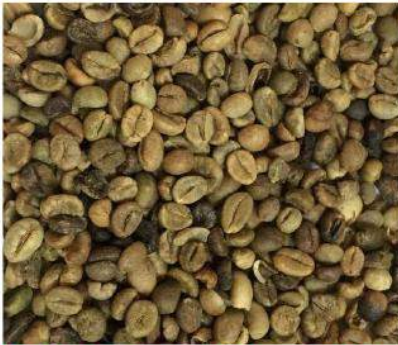
Arabica Screen 13 Unwashed