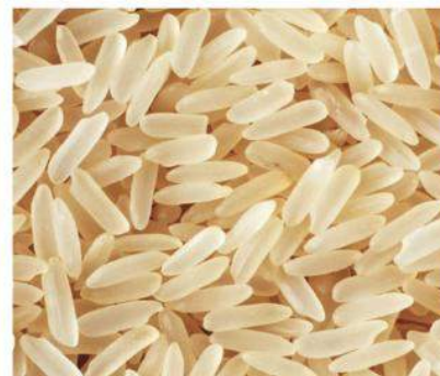
Long Grain Parboiled Rice 5% Broken