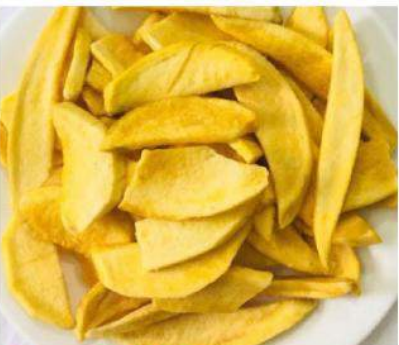
Crispy Dried Mango