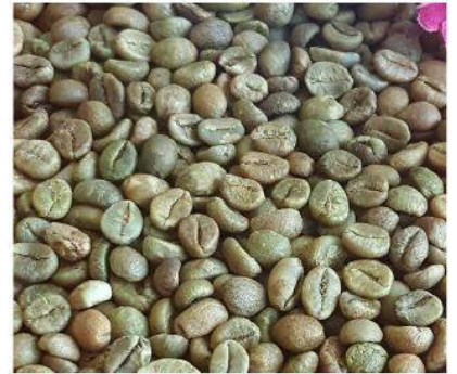
Robusta Screen 16 Unwashed