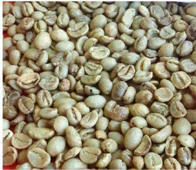
Arabica Screen 13 Wet Polished