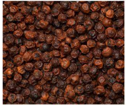
Freeze-Dried Red Pepper