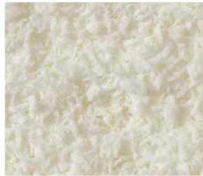
High Fat - Medium Grade