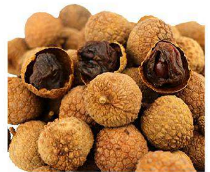
Soft Dried Lychee - Unshelled