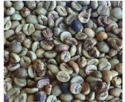
Arabica Screen 16 Unwashed