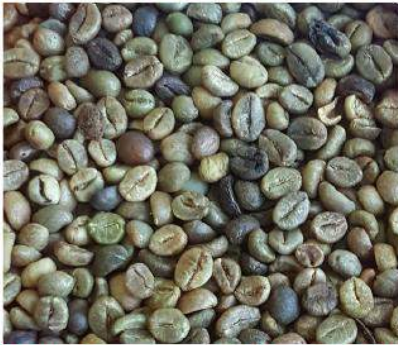
Robusta Screen 13 Unwashed