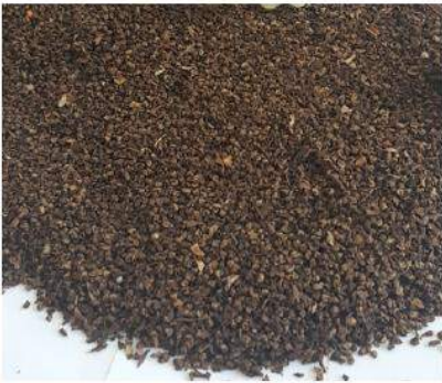
Pinhead Black Pepper 0.5-1mm