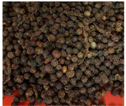
Black Pepper 550g/l FAQ