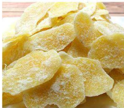
Soft Dried Ginger