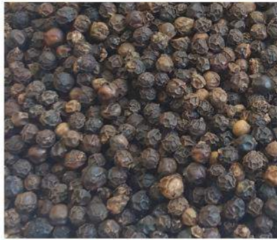
Black Pepper 570g/l Cleaned