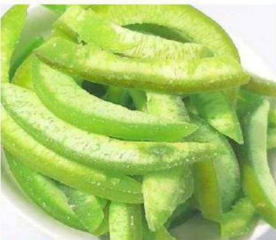
Soft Dried Pomelo