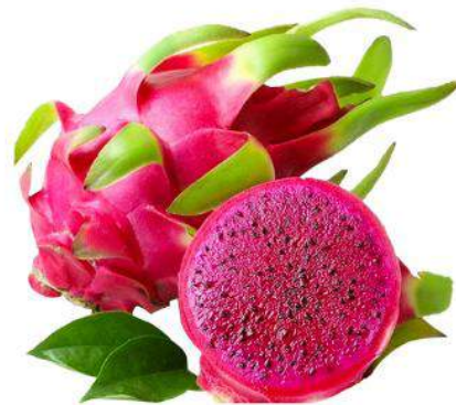
Fresh Red Dragon Fruit