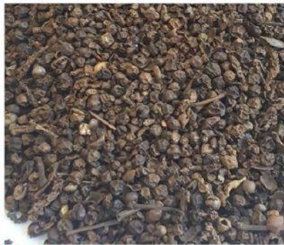
Light Berries Black Pepper 200g/l