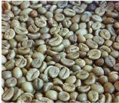
Robusta Screen 13 Wet Polished