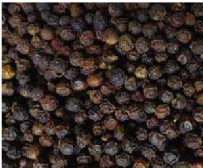
Black Pepper 5mm