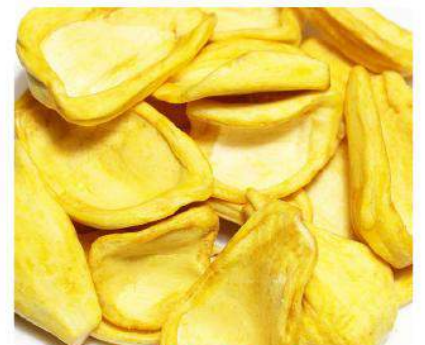
Crispy Dried Jackfruit