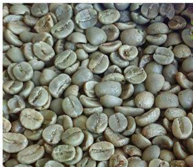
Arabica Screen 18 Unwashed