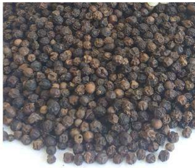
Black Pepper 500g/l Cleaned