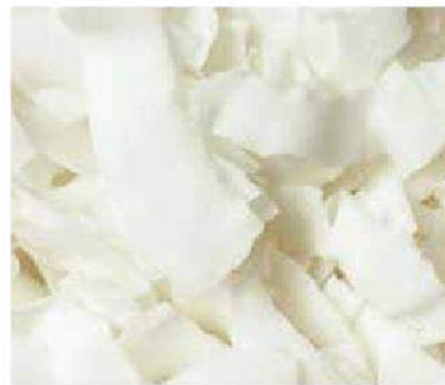
High Fat - Chip Grade