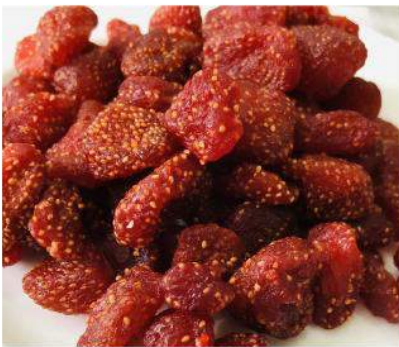
Soft Dried Strawberry