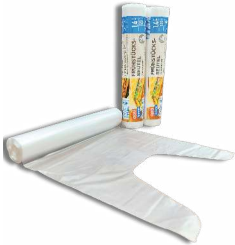
V SHAPE BAG