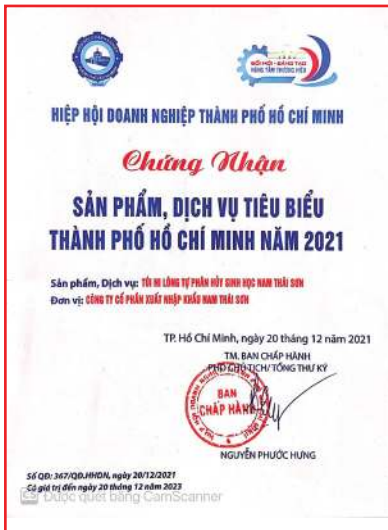
TYPICAL PRODUCTS AND SERVICES OF HCMC