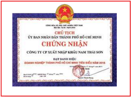
TYPICAL ENTERPRISES OF HCMC