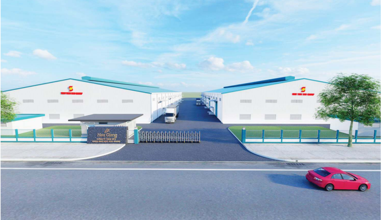
HAU GIANG BIO - PLASTIC FACTORY: (TAN PHU THANH IZ, TAN PHU THANH COMMUNE, CHAU THANH A DISTRICT, HAU GIANG PROVINCE)