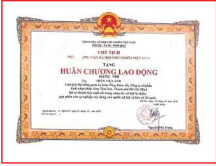
SECOND CLASS LABOR MEDAL