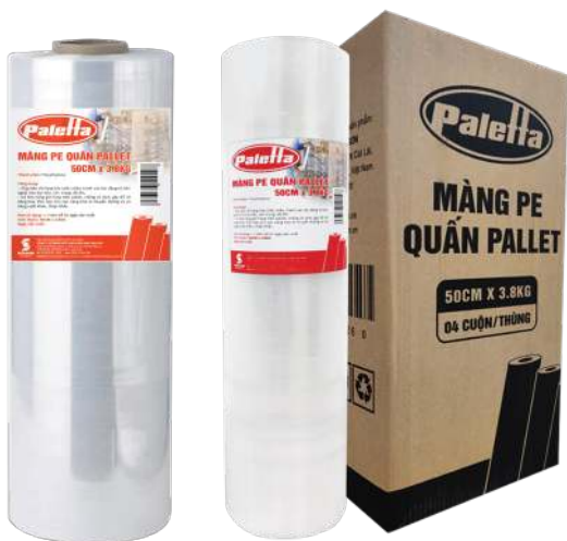
STRETCH WRAP FILM