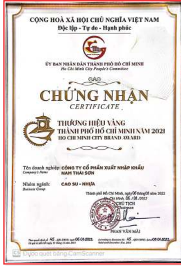
HCMC GOLDEN BRAND AWARD