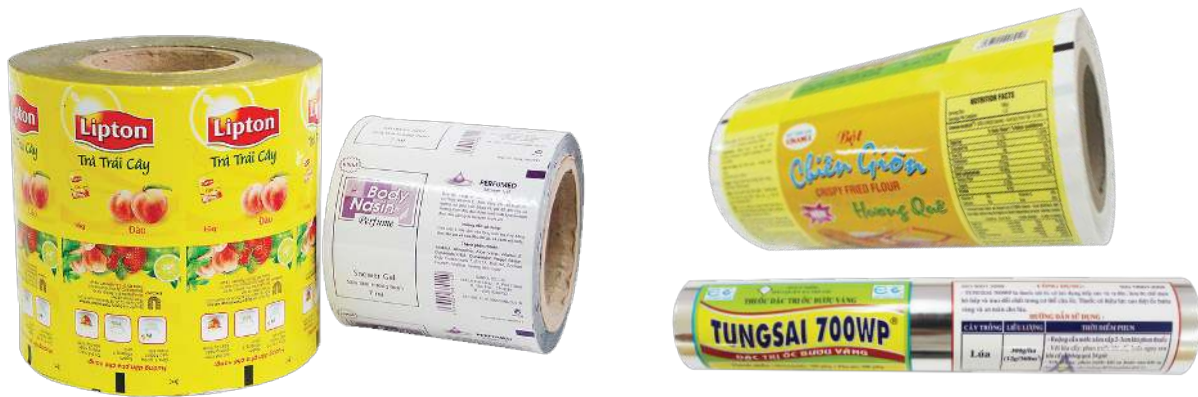
MULTILAYER PACKAGING FILM ROLL FOR PACKAGING MACHINE