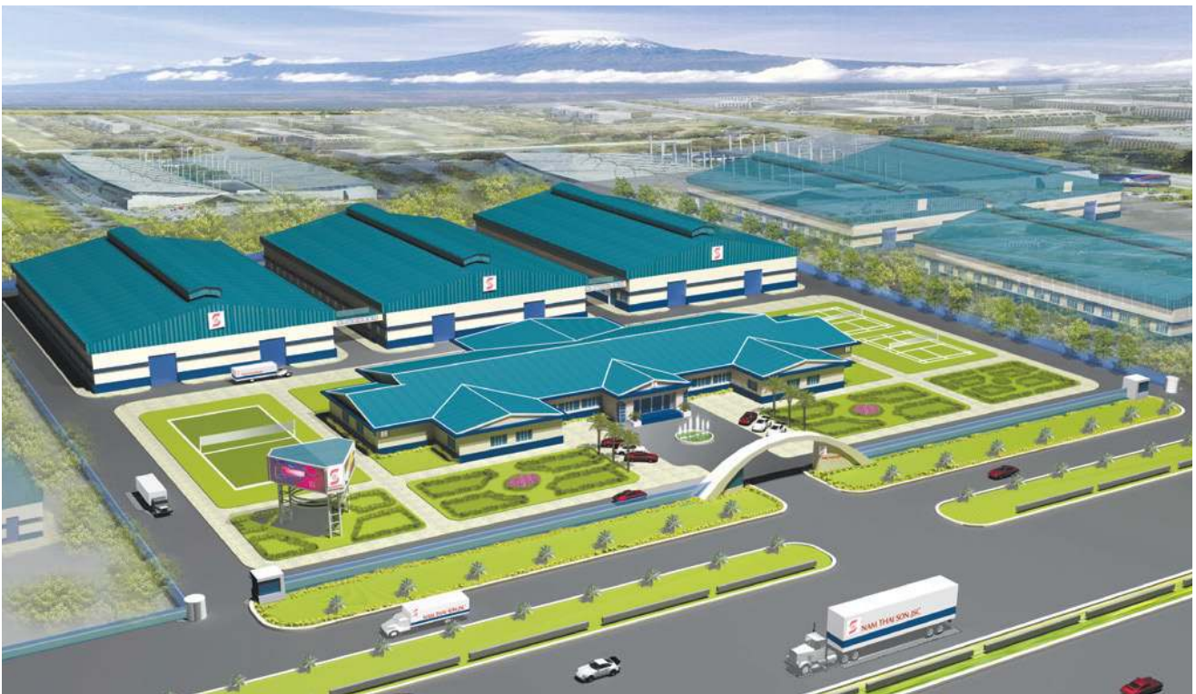
NORTHERN NAM THAI SON IMPORT EXPORT LTD.CO. (HAI DUONG PROVINCE)