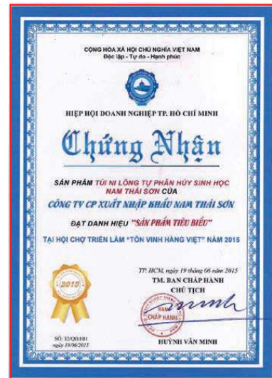
TYPICAL PRODUCTS TITLE