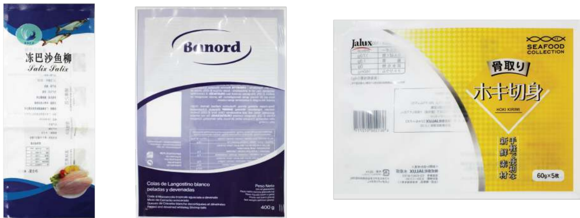
THREE SIDE SEAL BAG