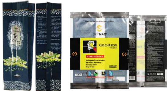
CENTRAL SEALING BAG