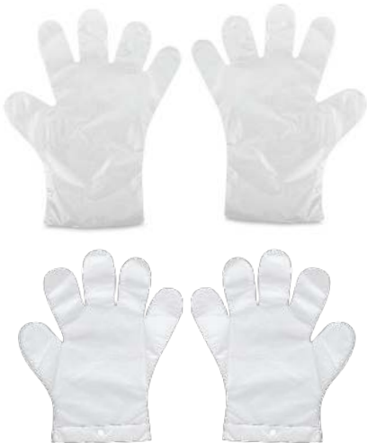
PLASTIC GLOVE IN LOOSE AND IN BLOCK