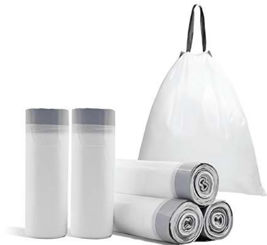
DRAW TAPE BAG ON ROLL