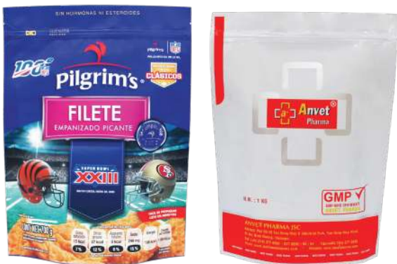
STANDING ZIPPER BAG