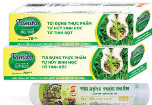
BIODEGRADABLE FOOD WRAP