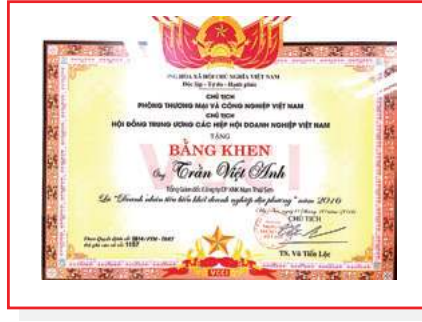
TYPICAL VIETNAMESE ENTREPRENEURS