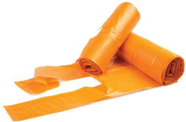
TSHIRT C FOLD BAG ON ROLL