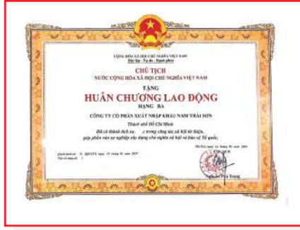
THIRD CLASS LABOR MEDAL