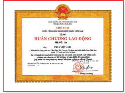
THIRD CLASS LABOR MEDAL