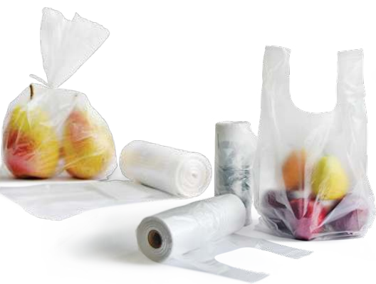
BAG ON ROLL WITH PAPER CORE