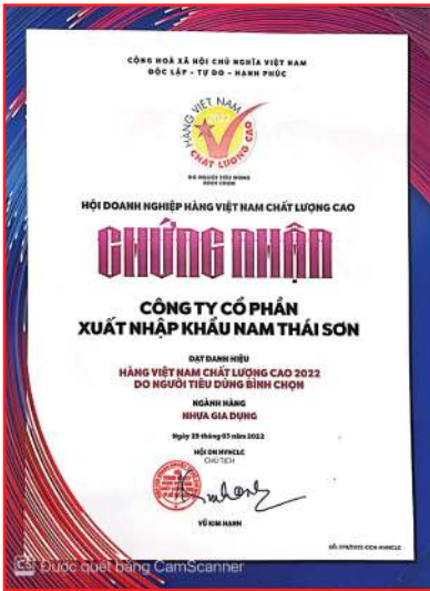
HIGH - QUALITY VIETNAMESE GOODS