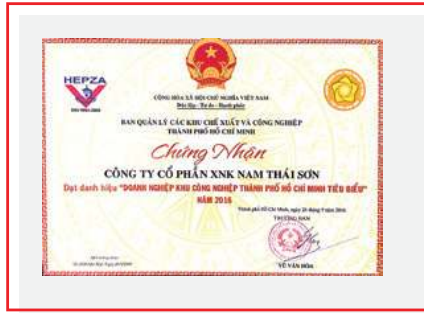
TYPICAL INDUSTRIAL ENTERPRISE OF HCMC