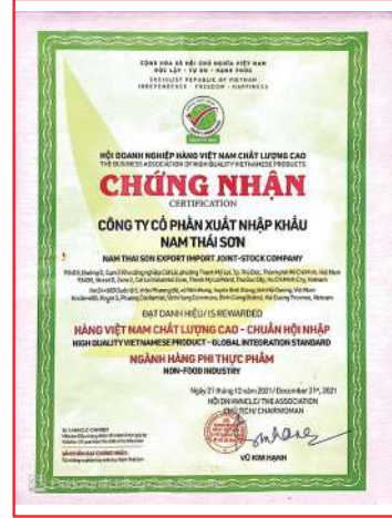
HIGH QUALITY VIETNAMESE PRODUCT - GLOBAL INTERACTION STANDARDS CERTIFICATE