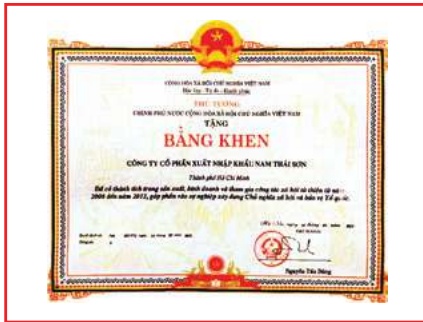
CERTIFICATE FROM PRIME MINISTER