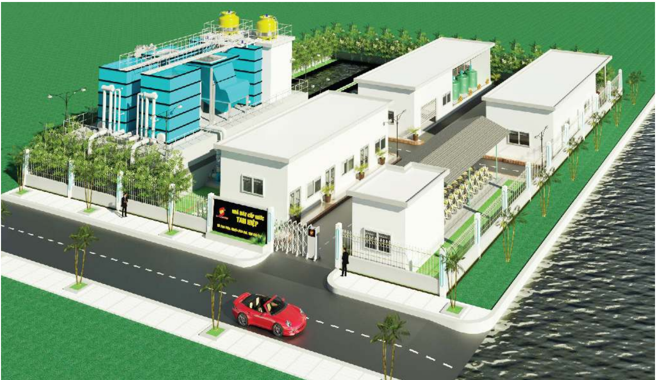
TAM HIEP WATER PLANT ( BEN TRE PROVINCE)