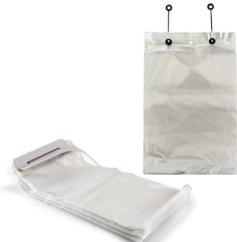
BLOCK HEAD BAG