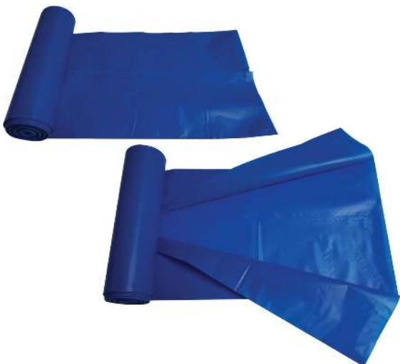
DOUBLE C FOLD / C FOLD BAG ON ROLL