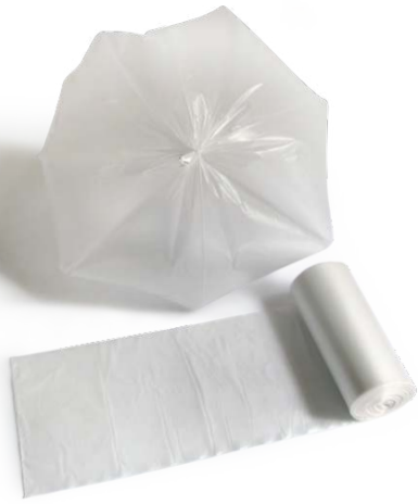
Flat star seal bag on roll