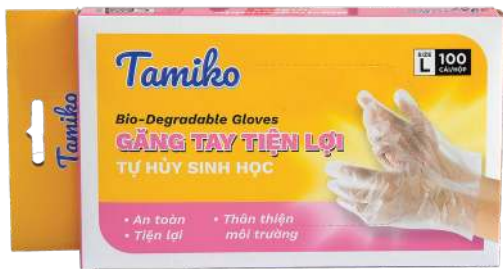
PLASTIC GLOVE IN LOOSE AND IN BLOCK