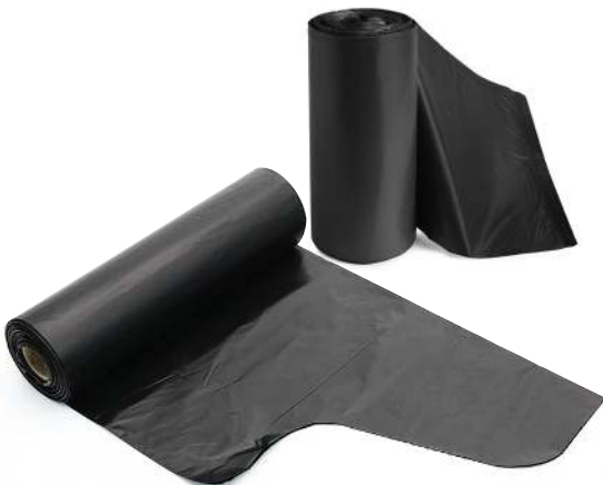
S SHAPE BAG ON ROLL