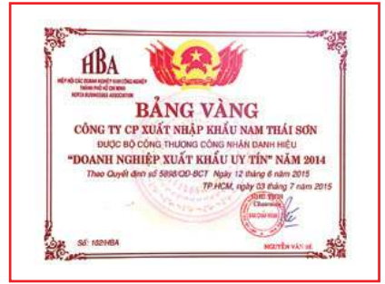
PRESTIGIOUS EXPORT ENTERPRISES