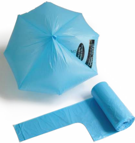
Tie handle star seal bag on roll