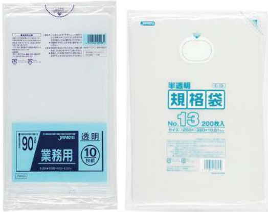
FOLDING GARBAGE BAG