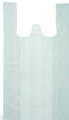
T-SHIRT BLOCK BAG