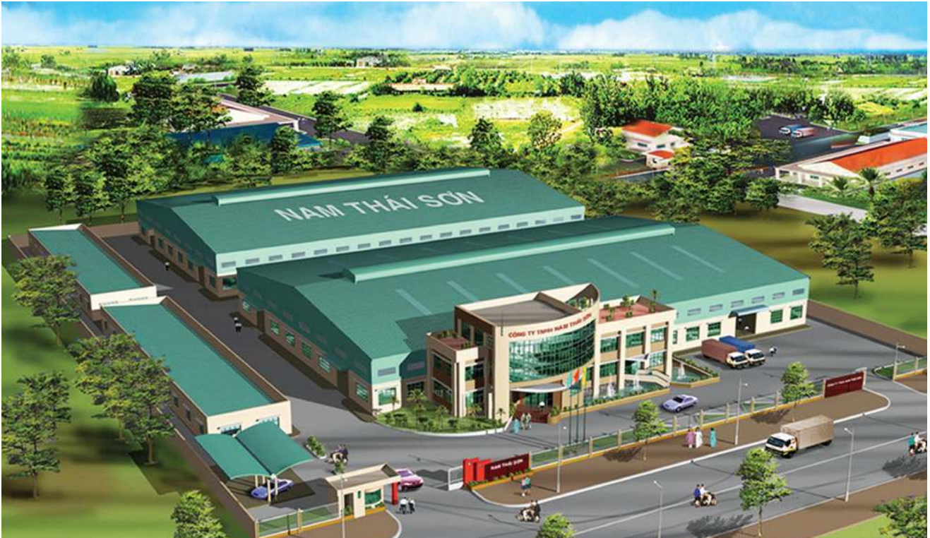
HO CHI MINH CITY HEAD OFFICE & FACTORY. (CAT LAI IDZ THU DUC CITY, HCMC)