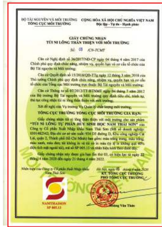
CERTIFICATE OF ENVIRONMENTAL FRIENDLY BAG