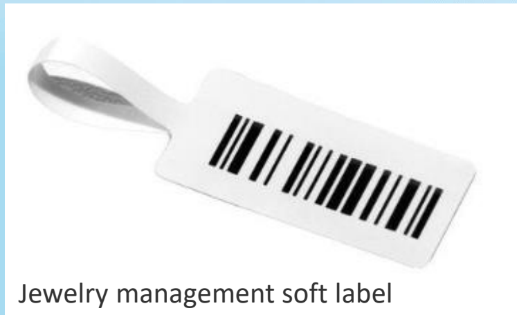
Jewelry management soft label

RFID (Radio Frequency Identification) tags are small devices that are integrated with a chip and an antenna to send and receive data via radio waves. These devices can be attached to various objects, products, or items to enable automatic identification and tracking in real time.