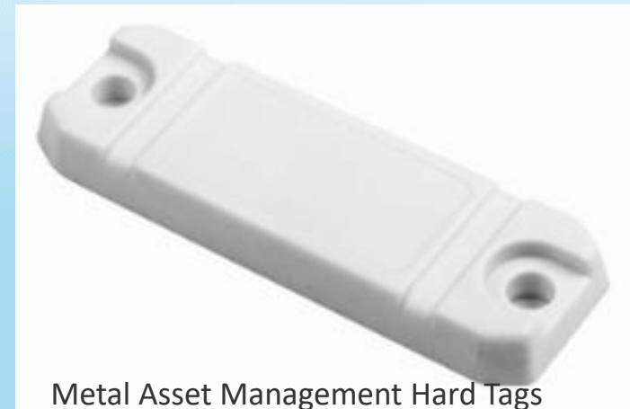
Metal Asset Management Hard Tags