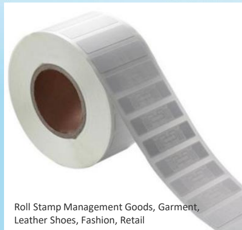
Roll Stamp Management Goods, Garment, Leather Shoes, Fashion, Retail