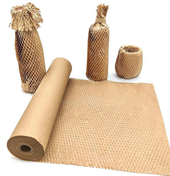
Honeycomb Packing Paper