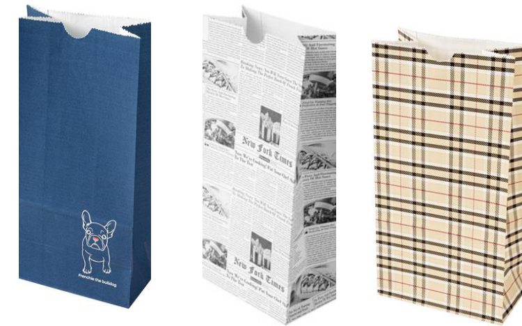
Printed Lunch Bags