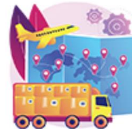
Packing - Shipping