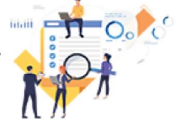
Listen to feedback Improve product