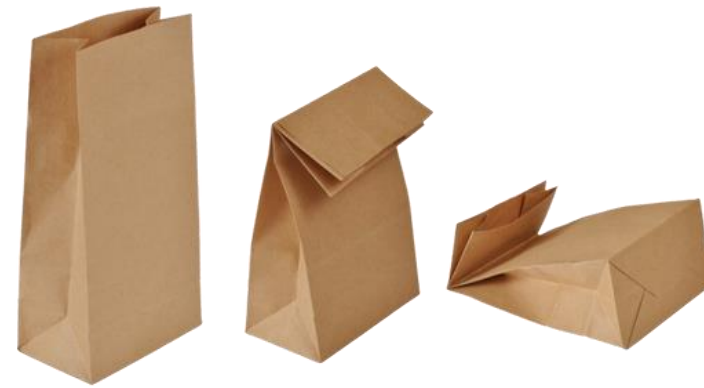
Generic Lunch Bags