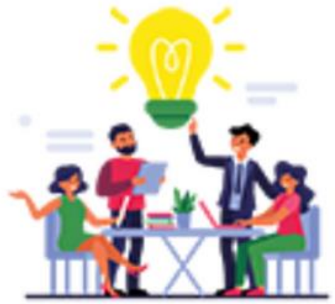
Mutual agreement with customer