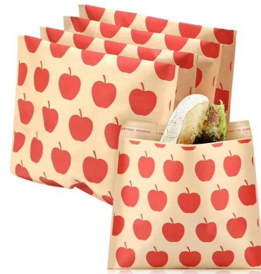
Printed Sandwich Bags